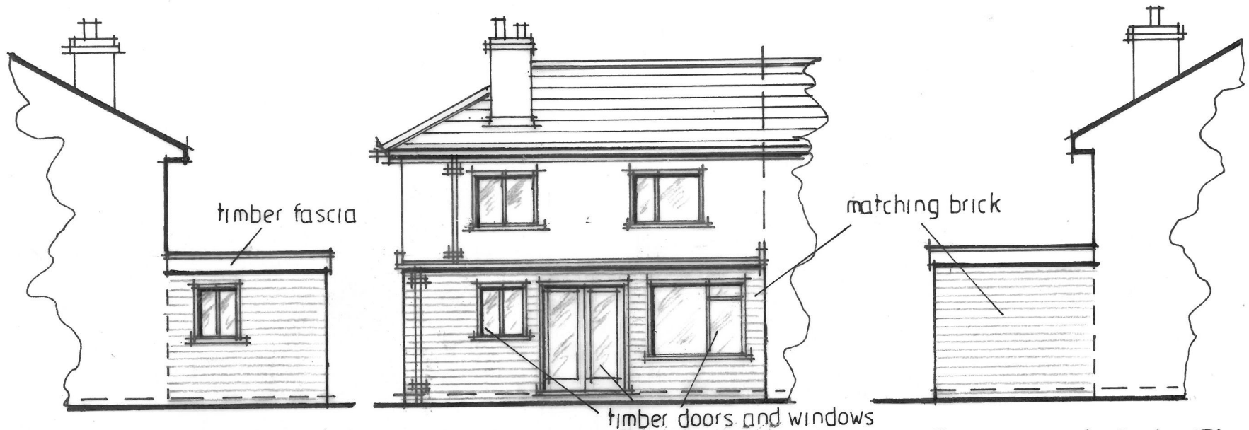
Proposed Side Elevation Proposed Back Elevation Proposed Side Elevation