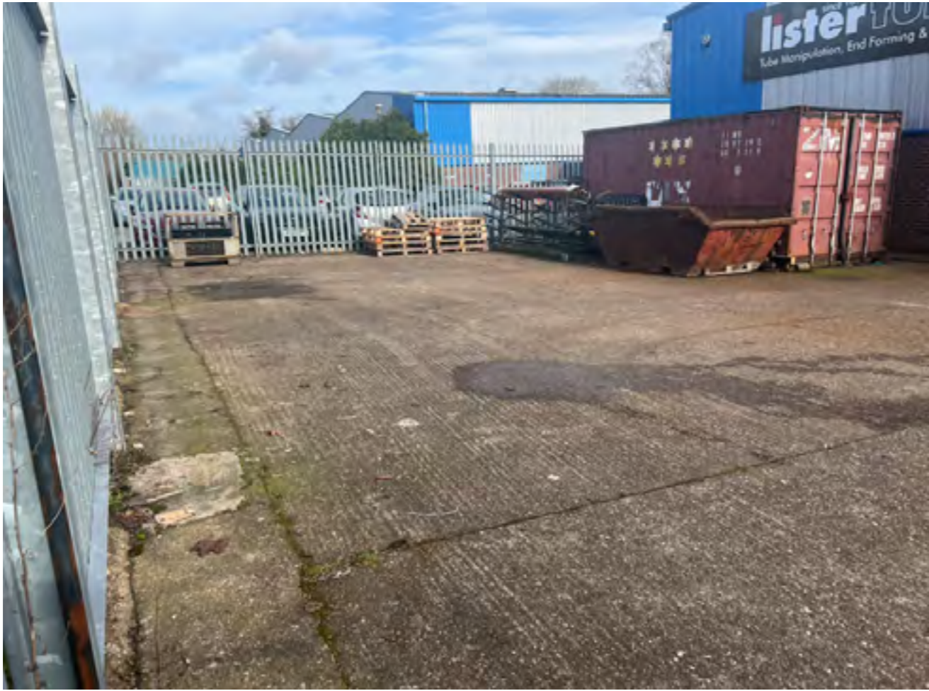
Proposed Building Location