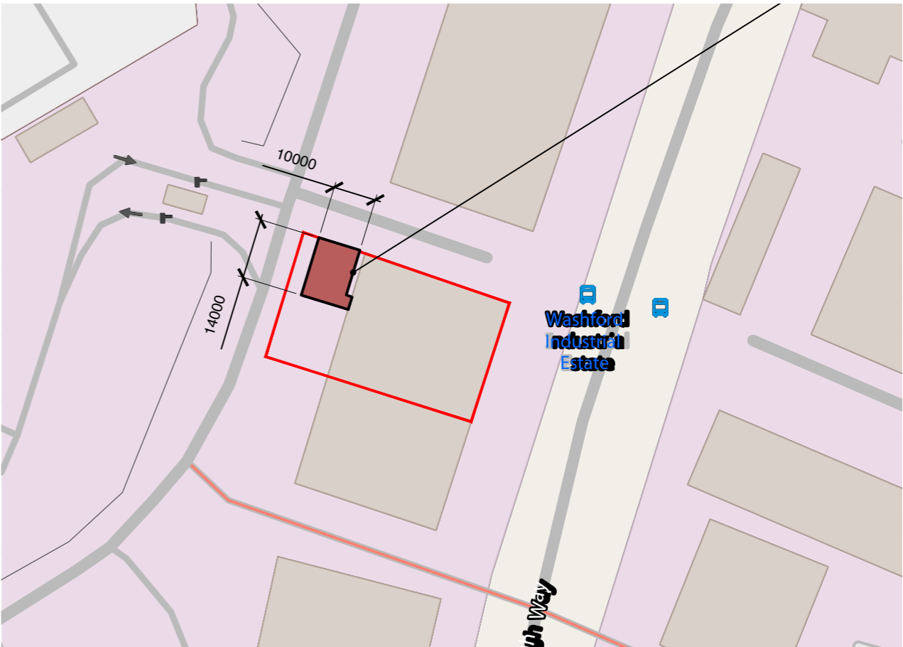
Proposed Site, new structure shown maroon