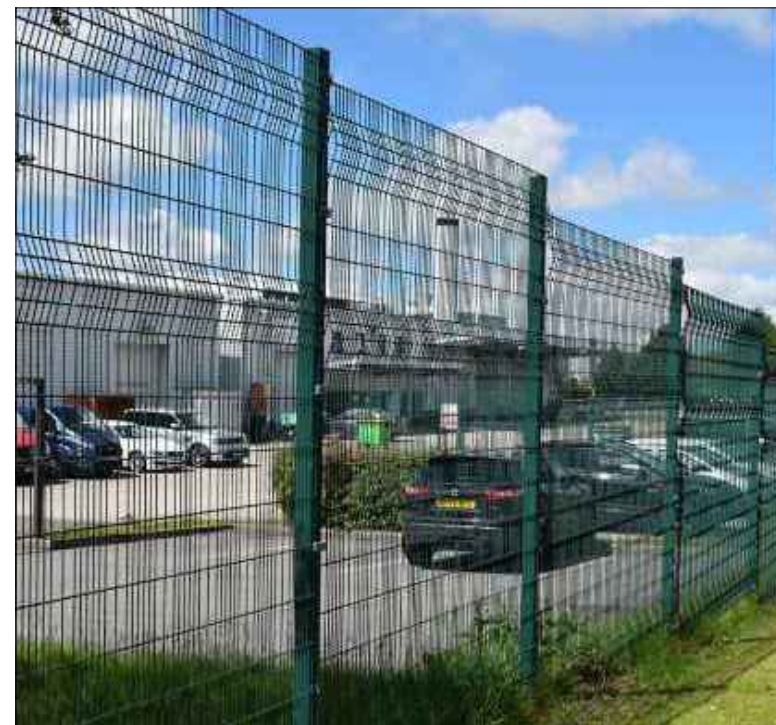
Typical Fencing Panel