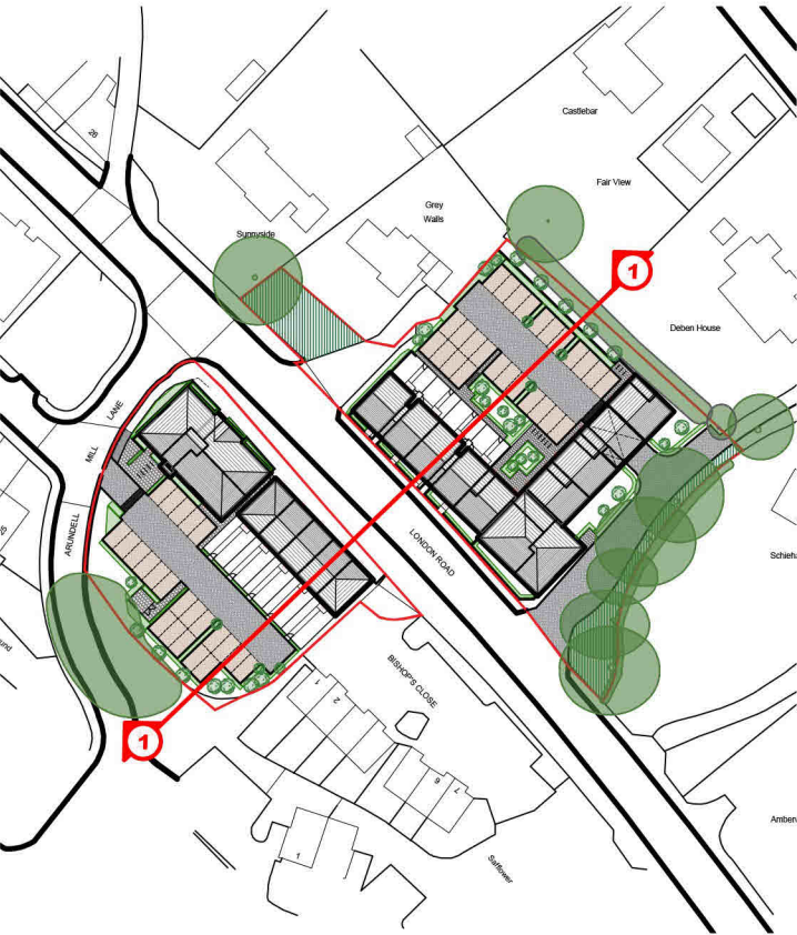
REFERENCE PLAN NTS

NOTES: Sections are indicative. All finished floor levels and site levels to be confirmed by the civil engineer at detailed design stage.