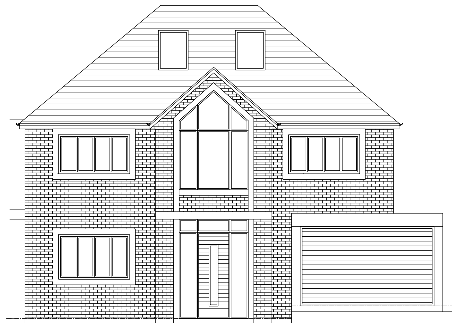
Front Elevation Approved PL/2023/00849/MINFHO