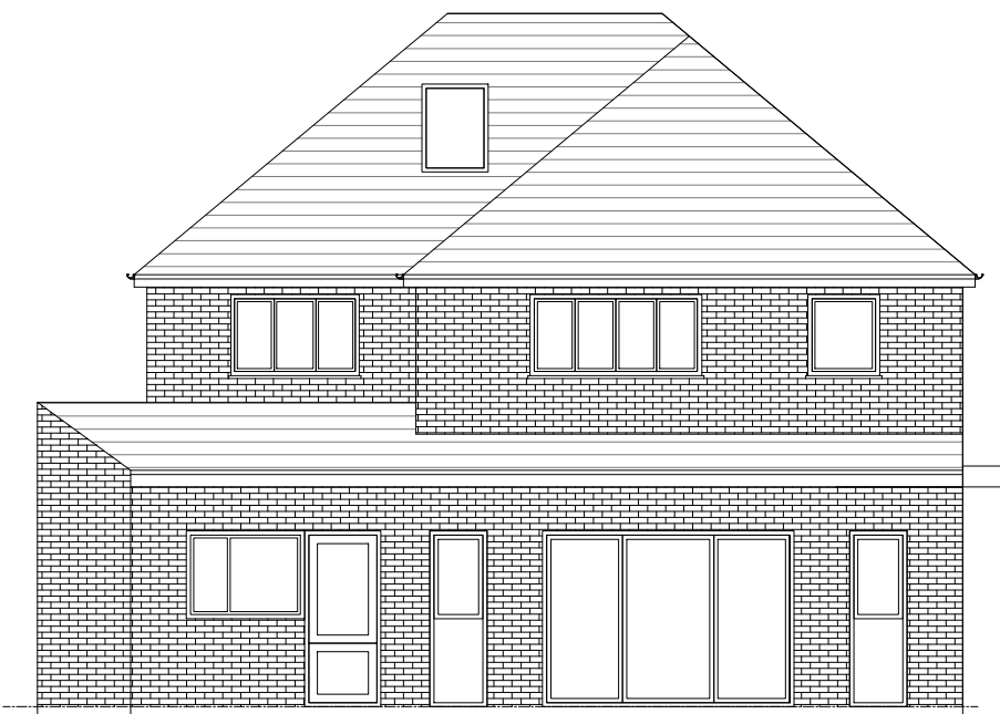
Rear Elevation Approved PL/2023/00849/MINFHO