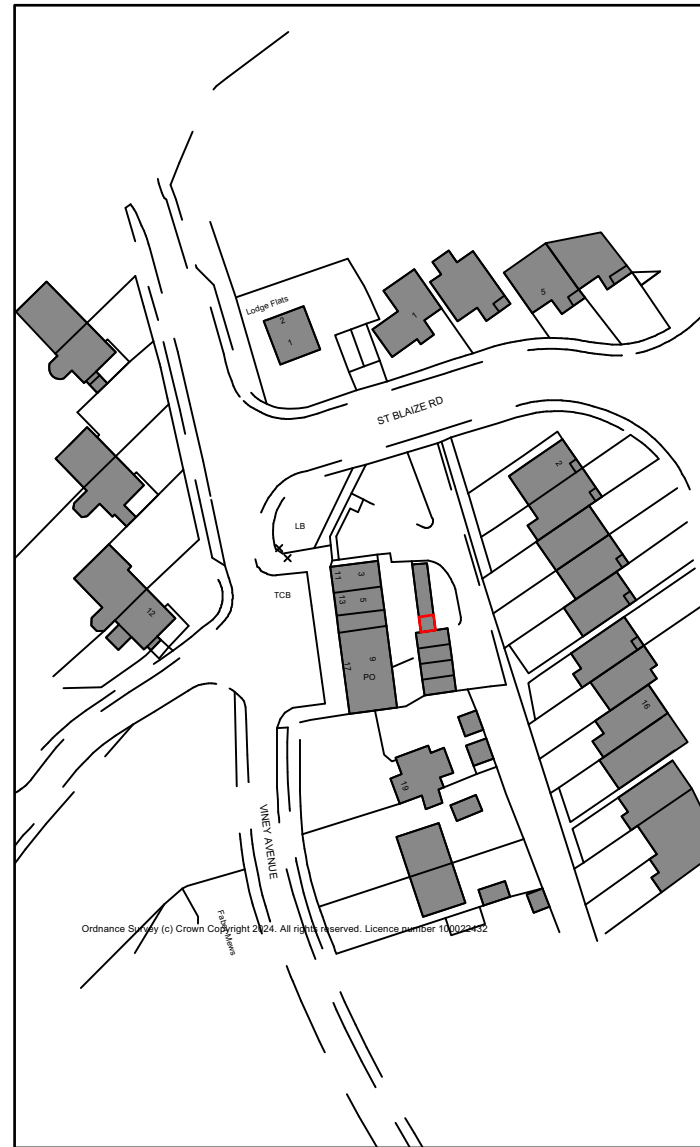
EXISTING SITE LOCATION PLAN