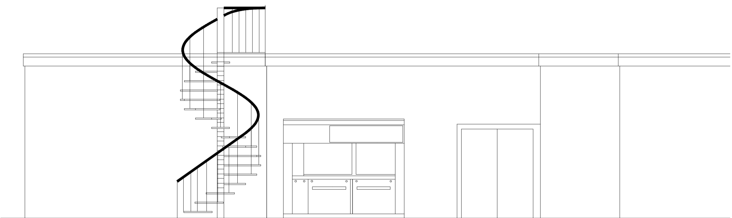
2 EXISTING REAR ELEVATION B-B 1:50