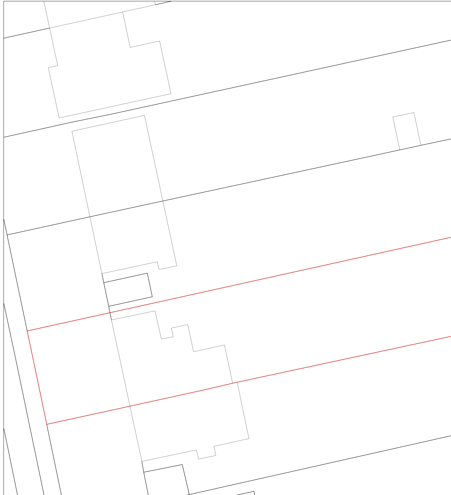
EXISTING 1:200 SITE PLAN