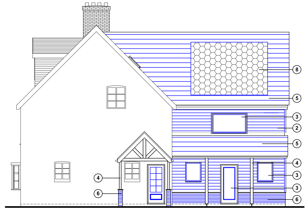
East (front) elevation