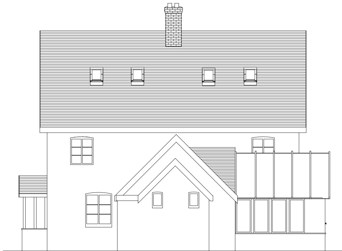
North (side) elevation