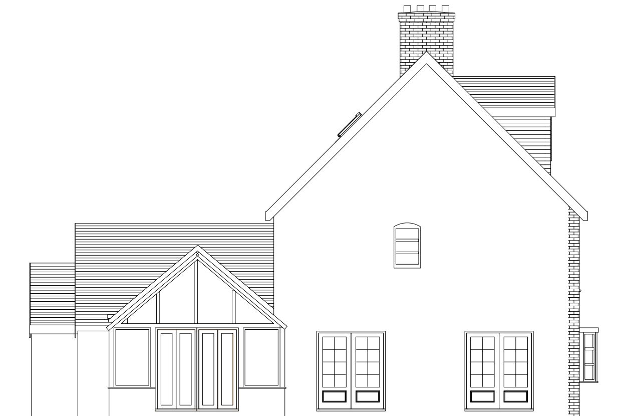
West (side) elevation