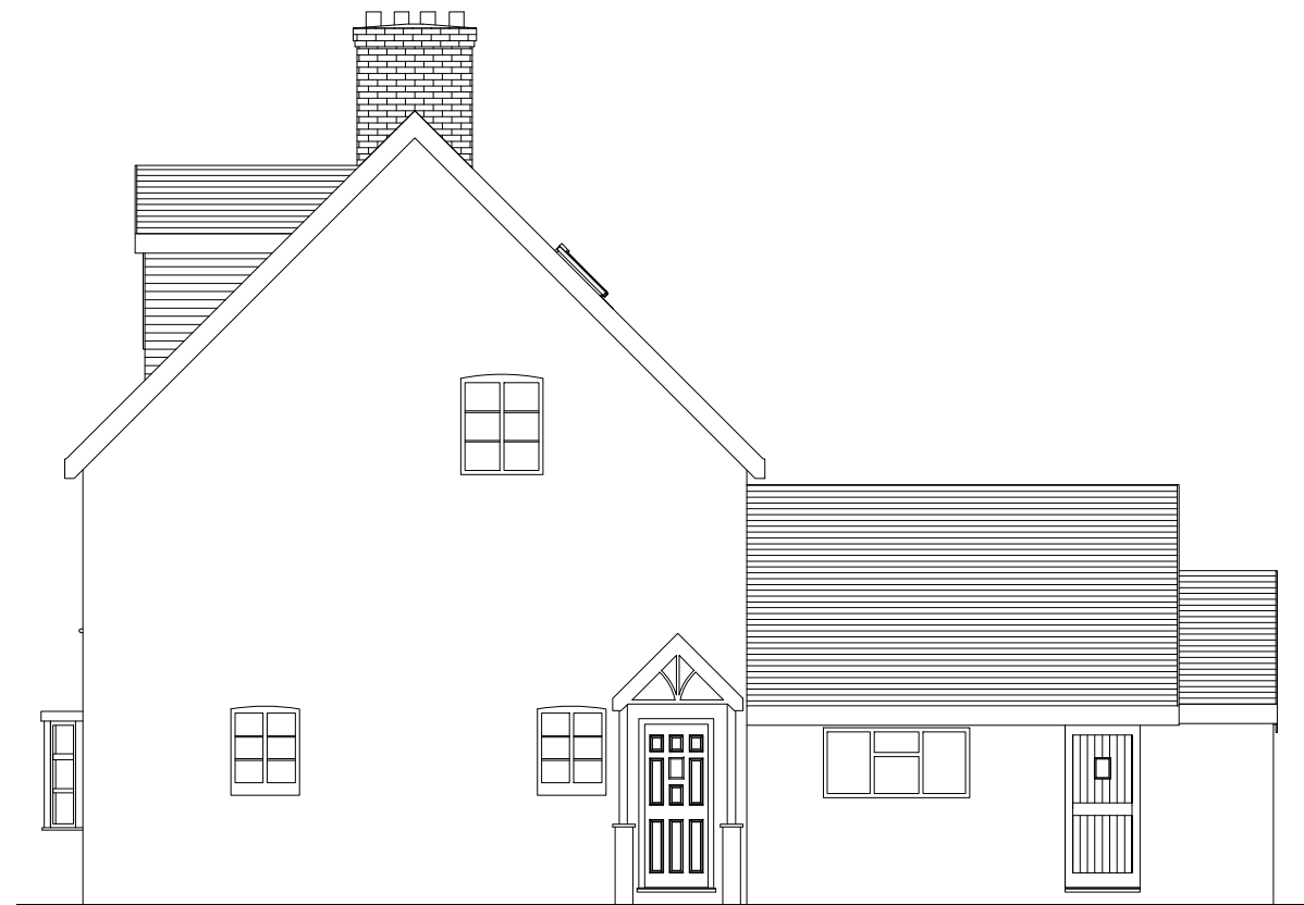
East (front) elevation