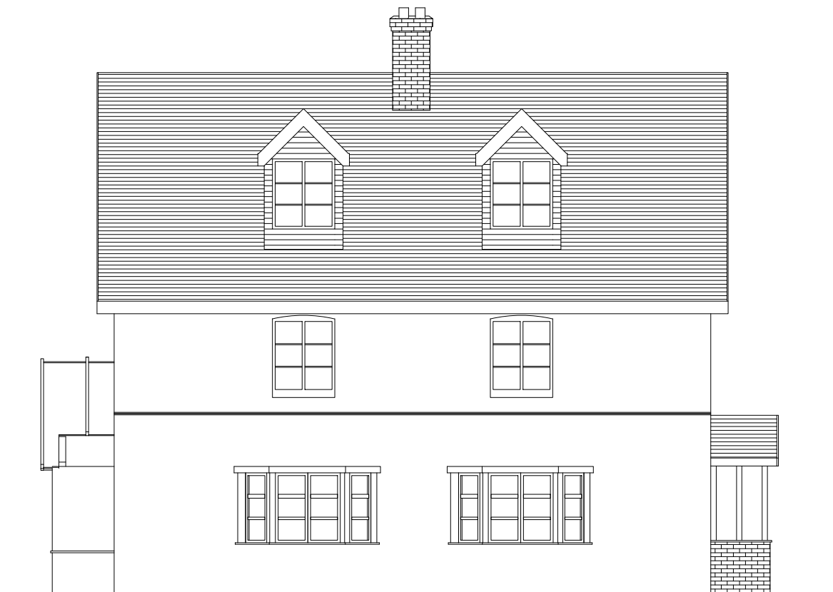
South (rear) elevation