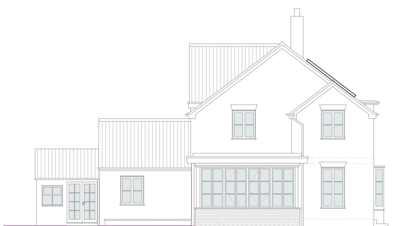
AS PROPOSED SIDE ELEVATION (SOUTH)