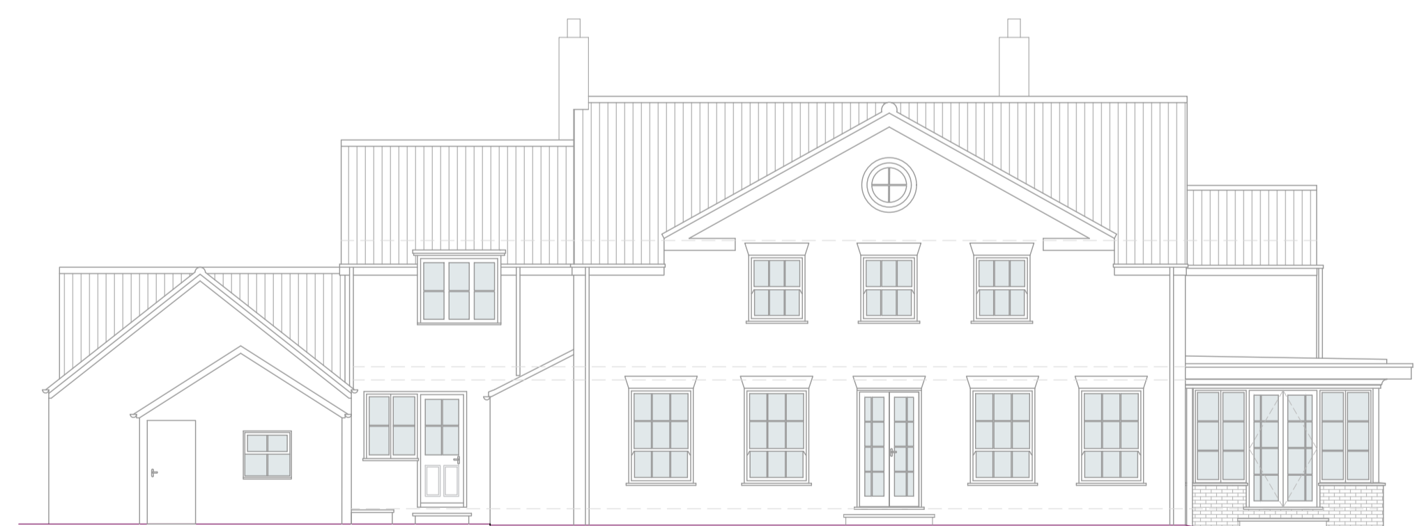
AS PROPOSED REAR ELEVATION (WEST)