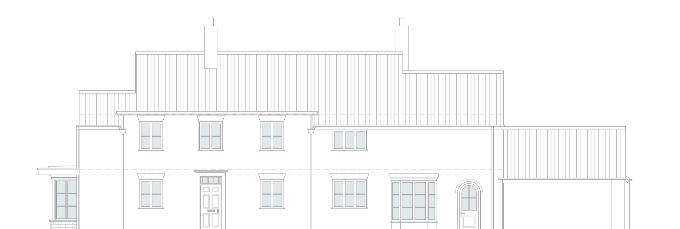
AS PROPOSED FRONT ELEVATION (EAST)