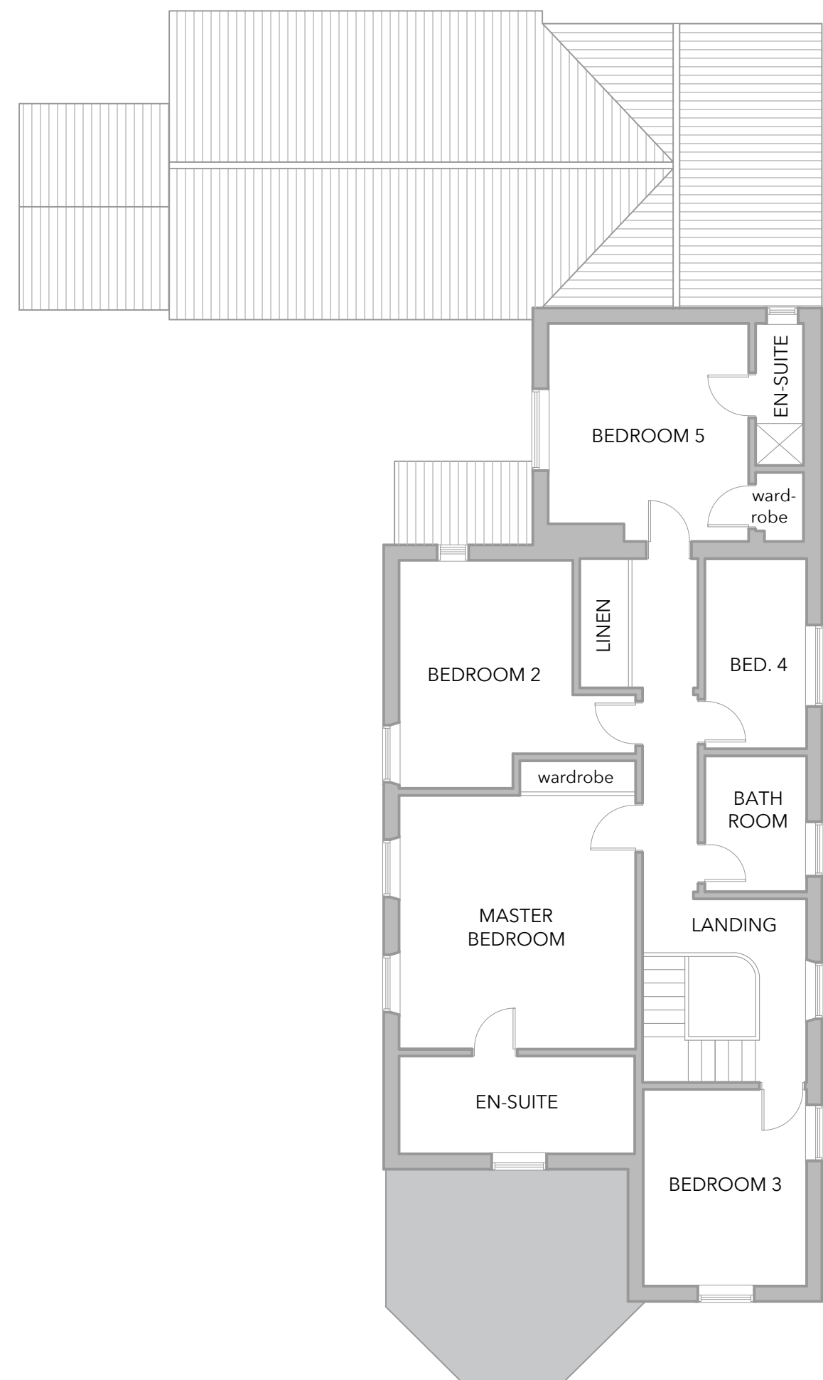
AS EXISTING FIRST FLOOR PLAN