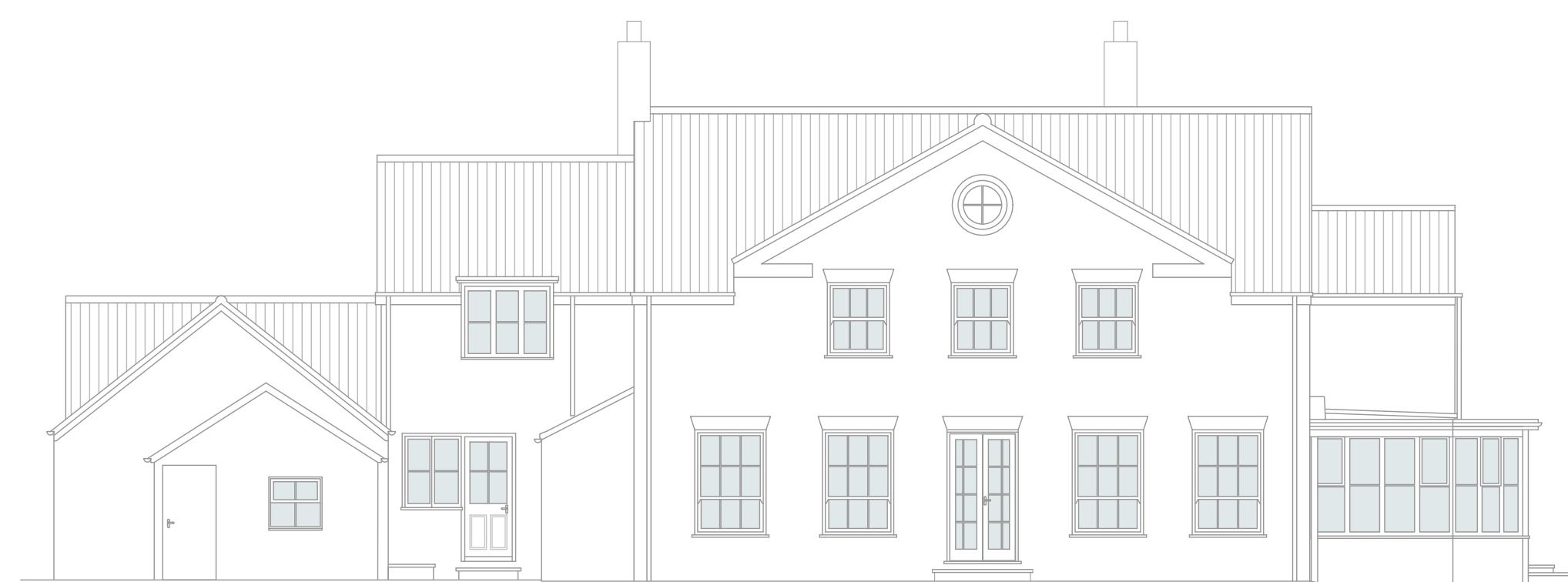
AS EXISTING REAR ELEVATION (WEST)