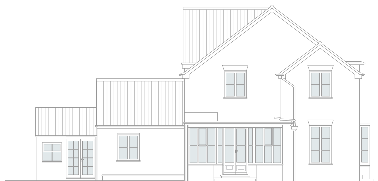
AS EXISTING SIDE ELEVATION (SOUTH)