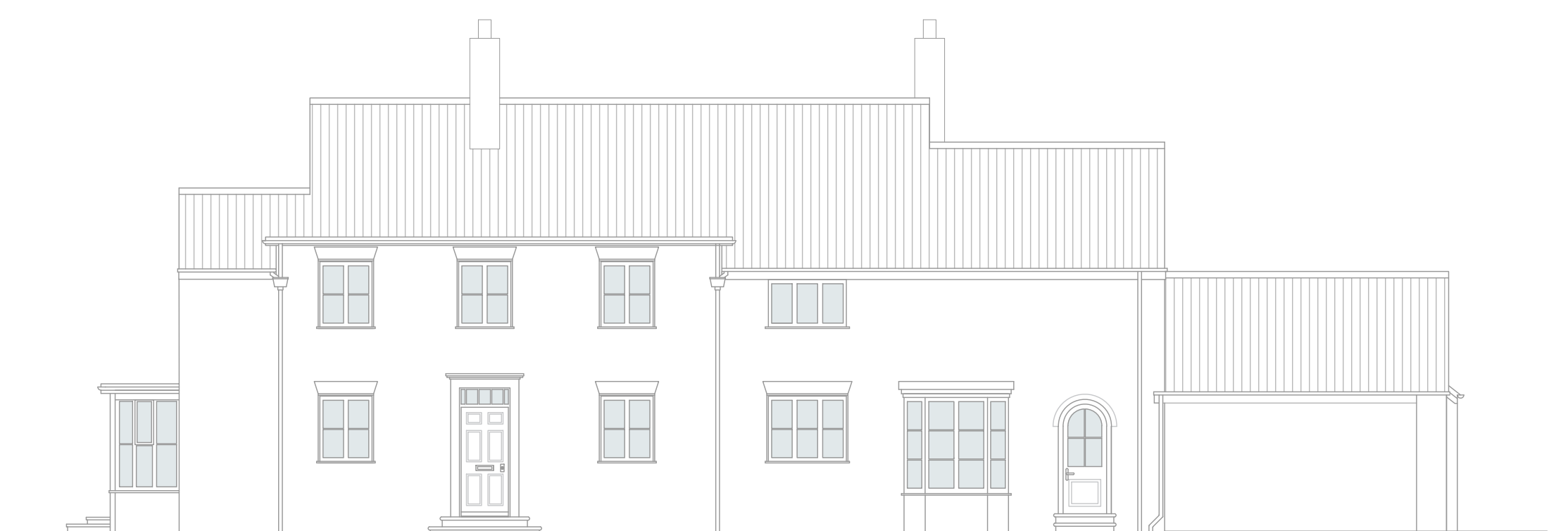
AS EXISTING FRONT ELEVATION (EAST)