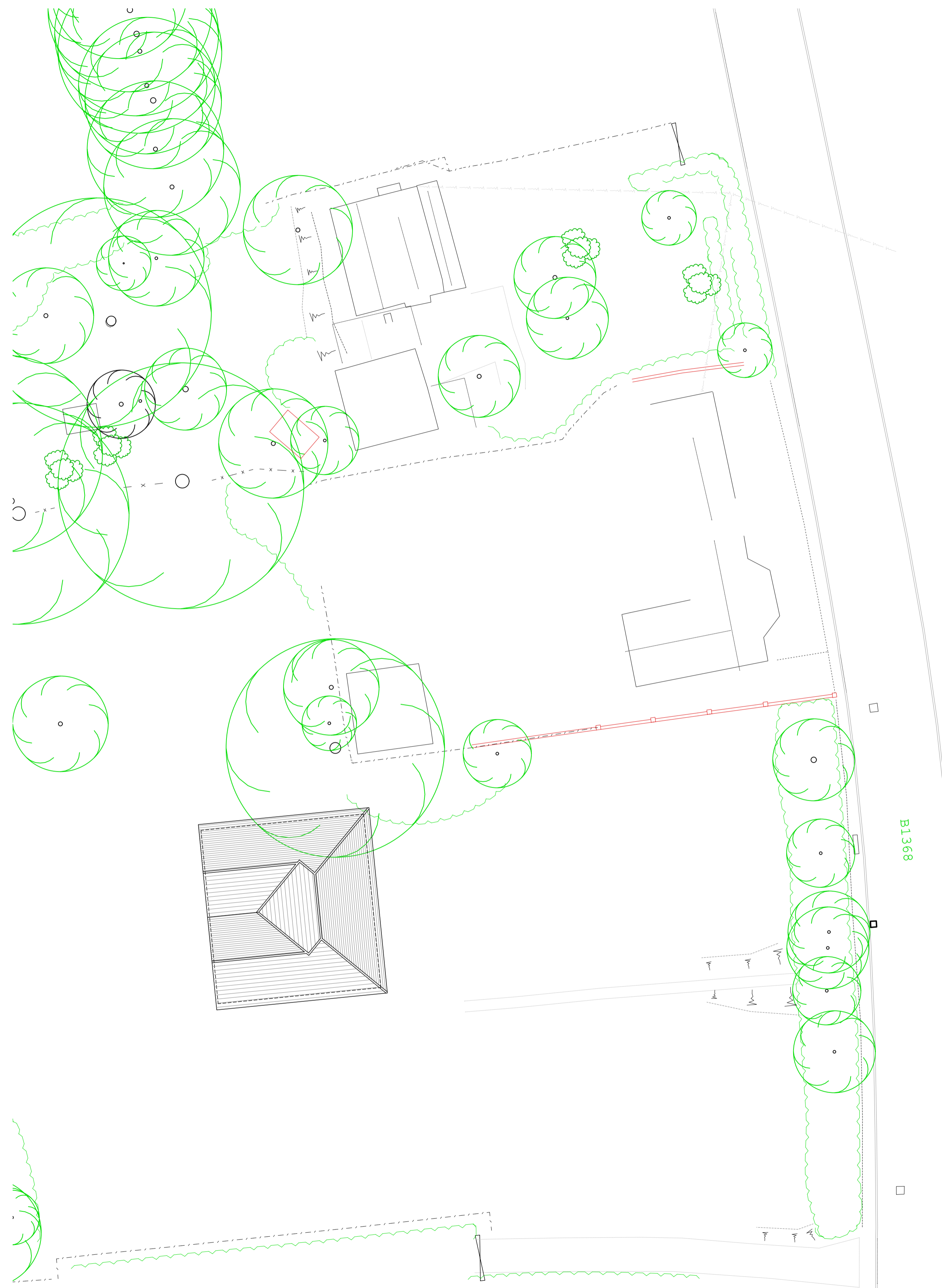
Proposed Site Plan (1:200)