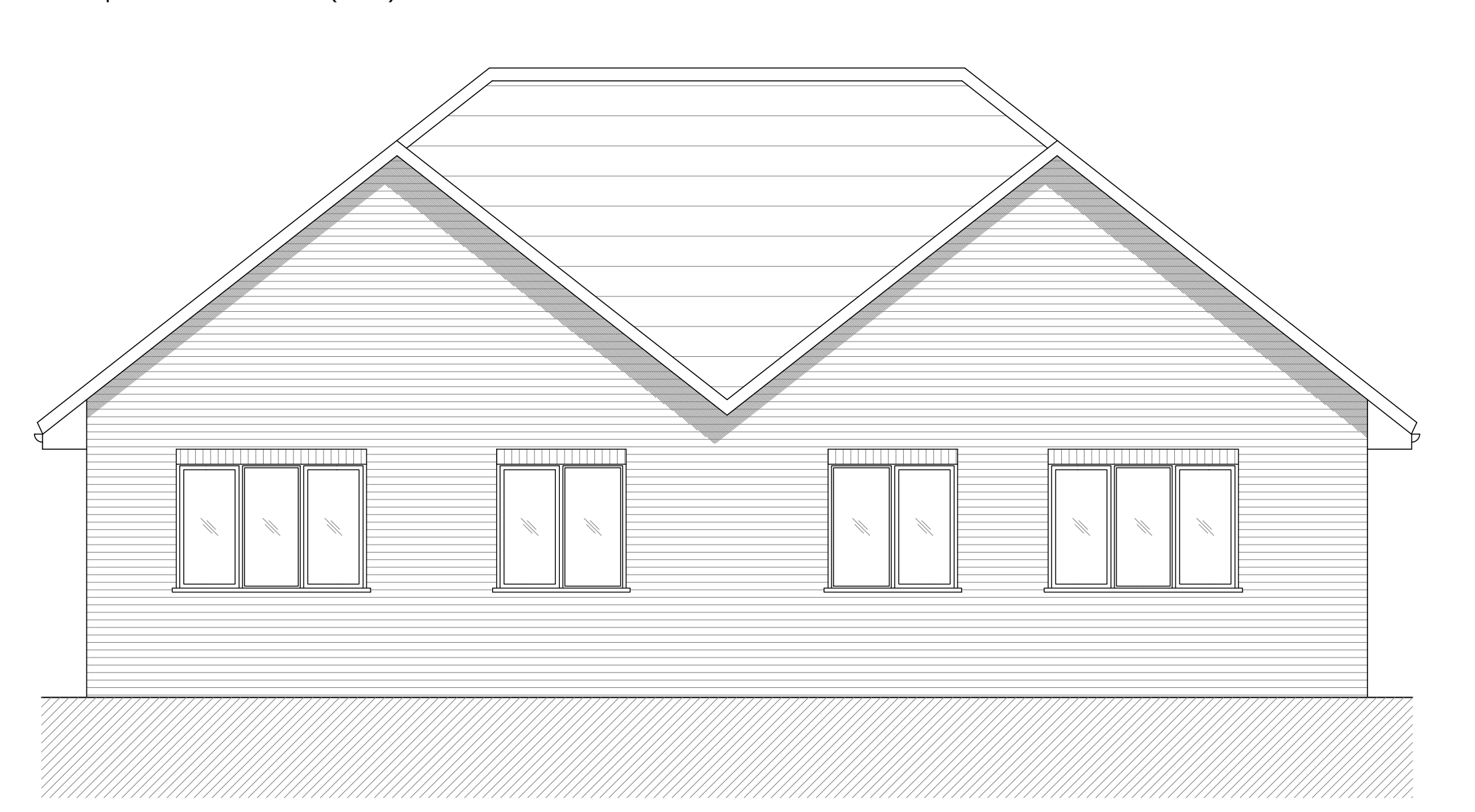
Proposed Rear Elevation (1:50)