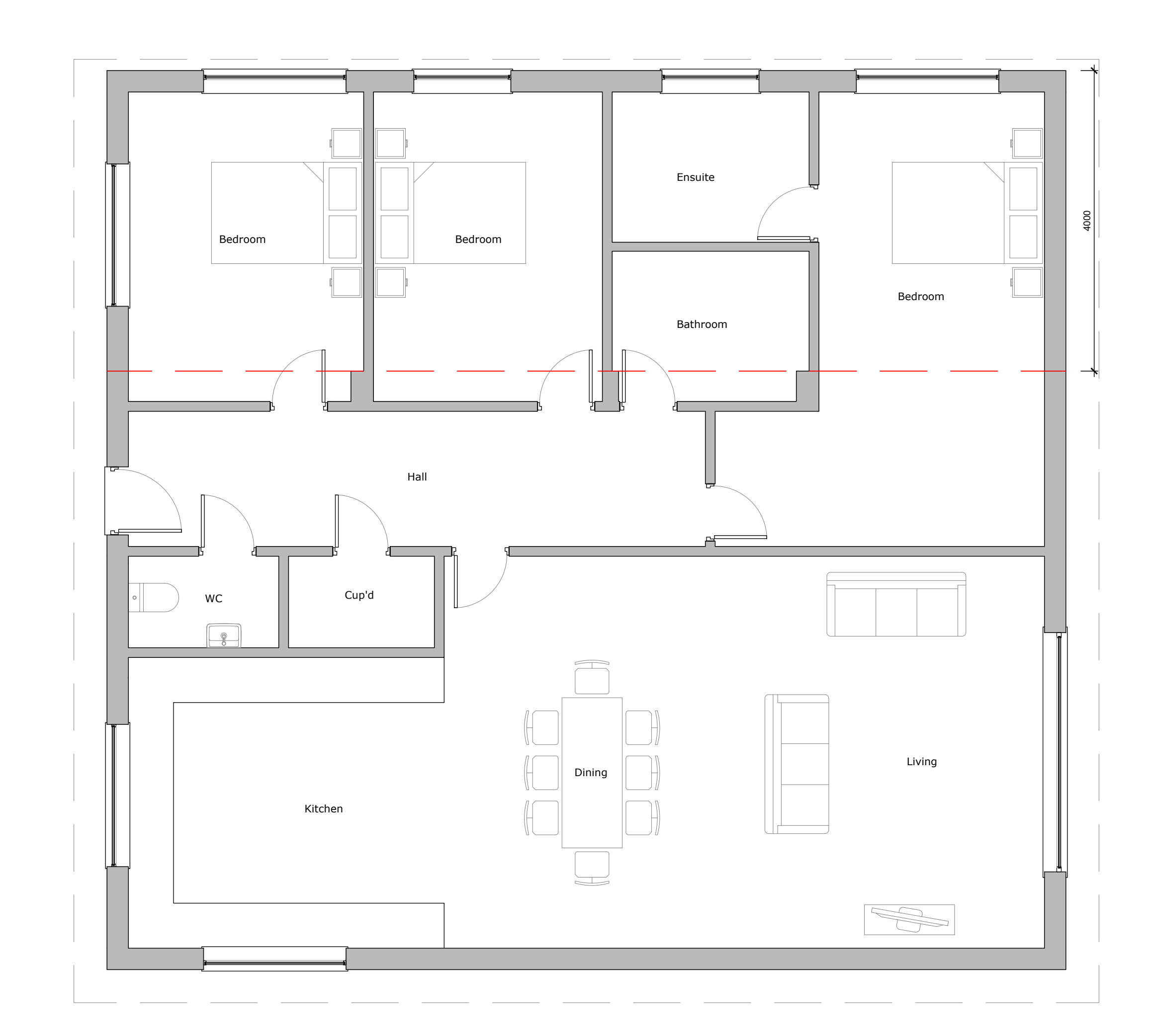
Proposed Ground Floor Plan (1:50)