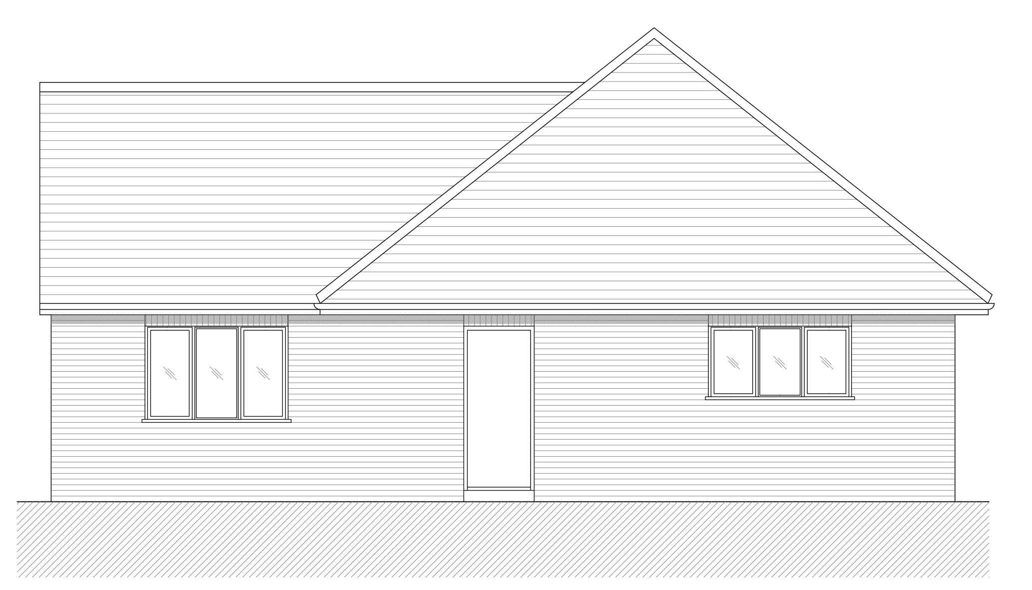
Proposed Side Elevation (1:50)