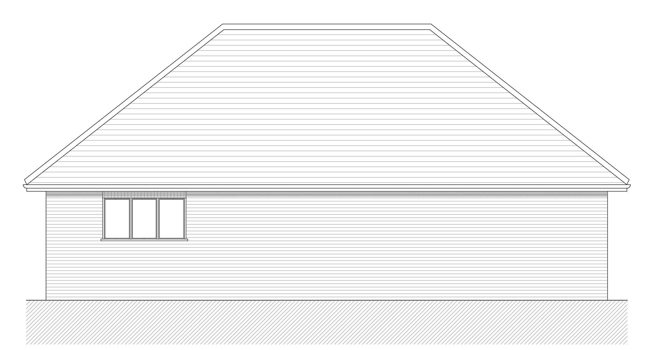
Proposed Front Elevation (1:50)