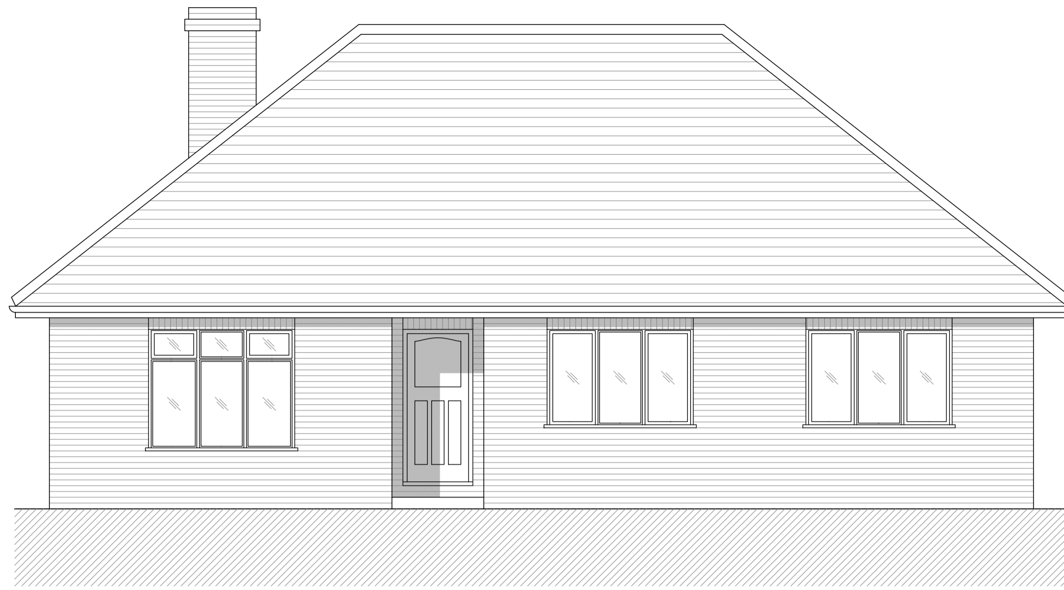
Existing Front Elevation (1:50)