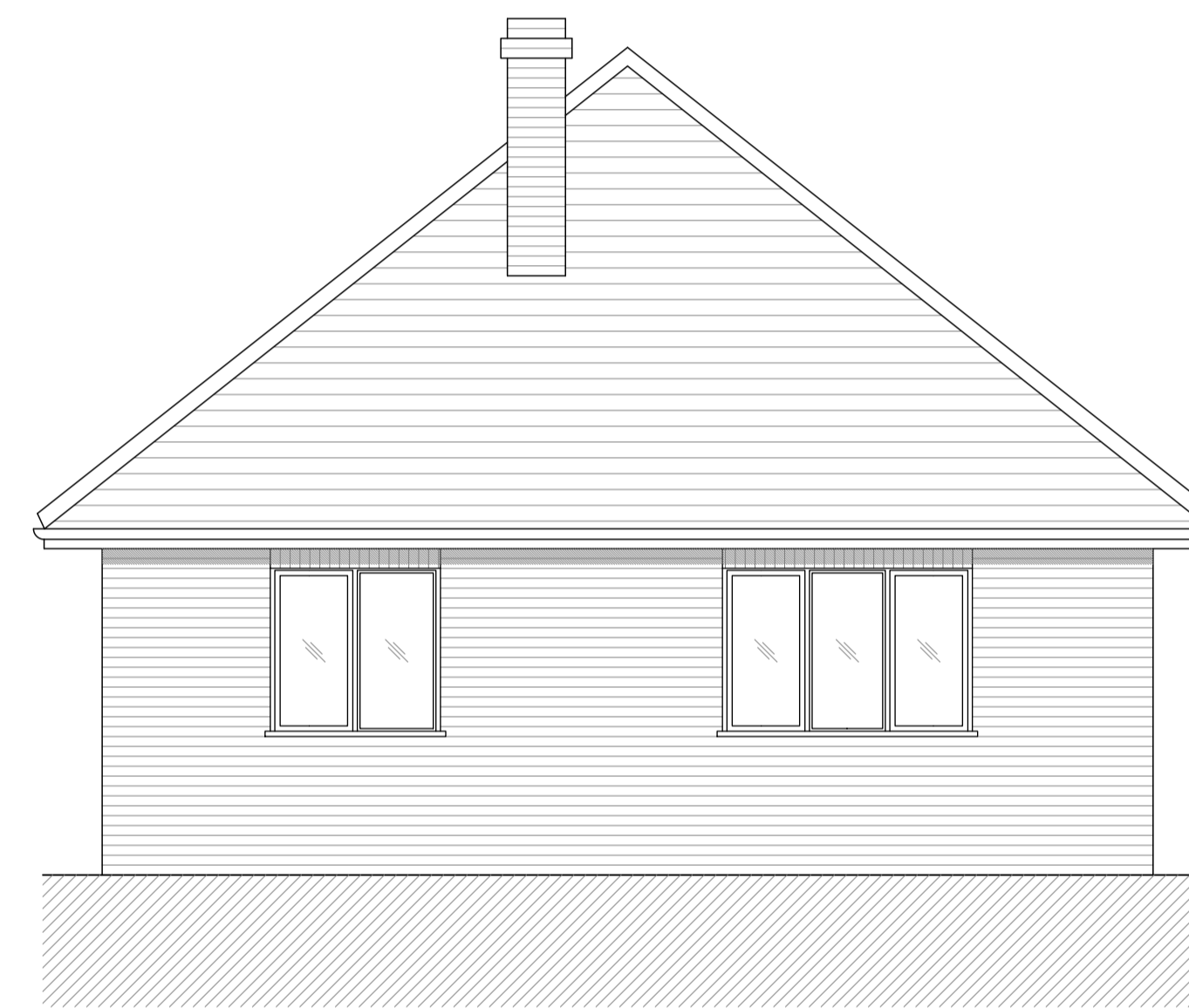
Existing Side Elevation (1:50)