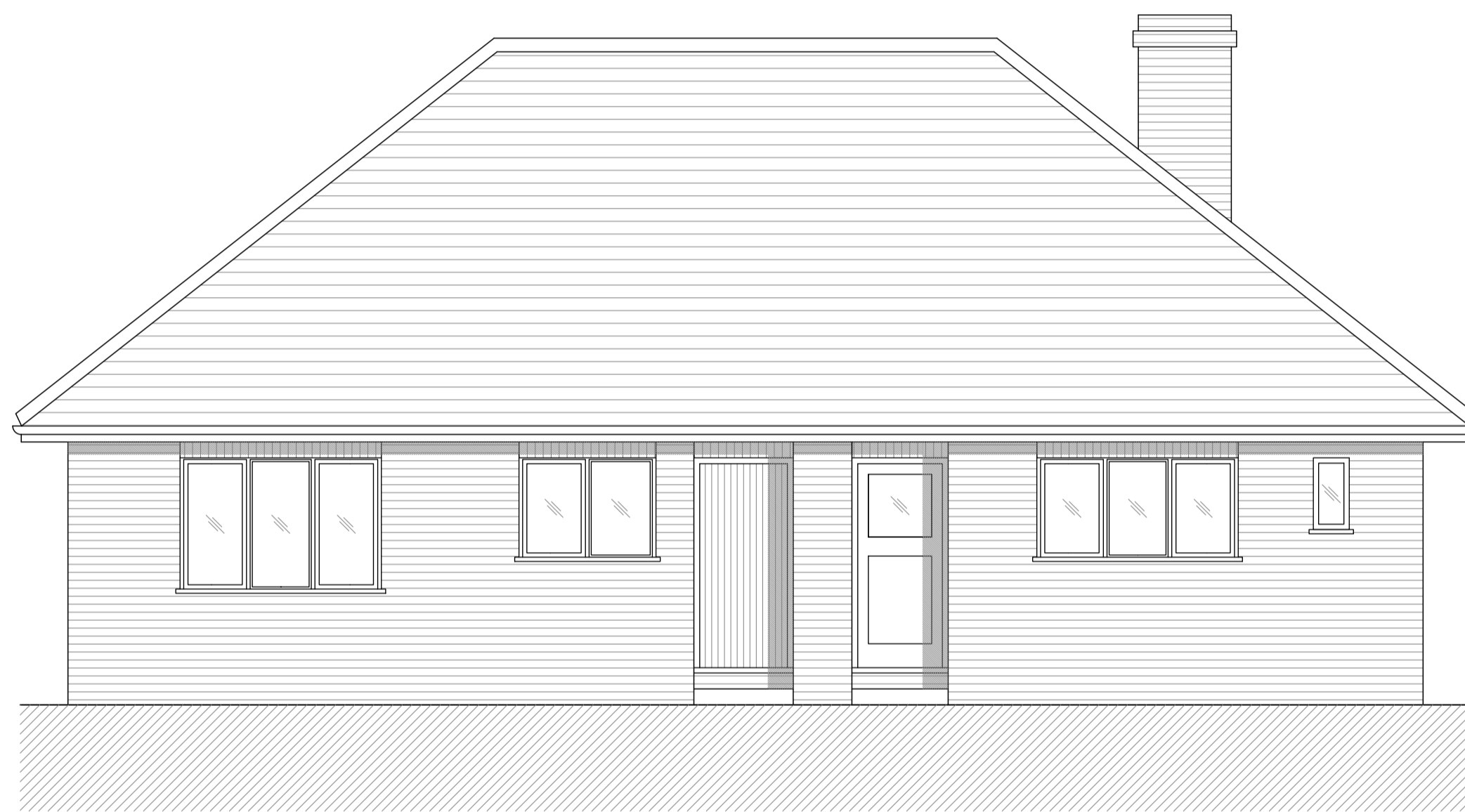
Existing Rear Elevation (1:50)