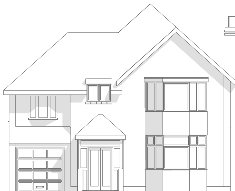
1:100 existing west elevation