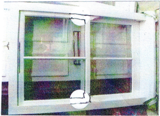
PHOTOGRAPH OF REPLACEMENT SASH (NTS)

NOTE WINDOWS HIGHLIGHTED IN PALE BLUE TO BE CHECKED FOR CONDITION REPLACE IN PURPOSE MADE TRICOYA TIMBER SASH WINDOWS TO DETAIL SUBJECT TO PLANNING.