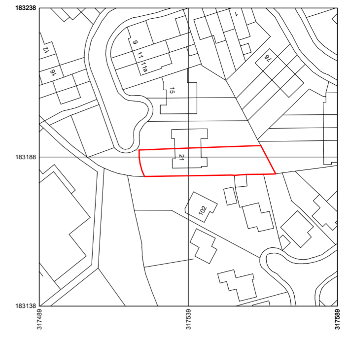
Location Plan Scale: 1 : 1250