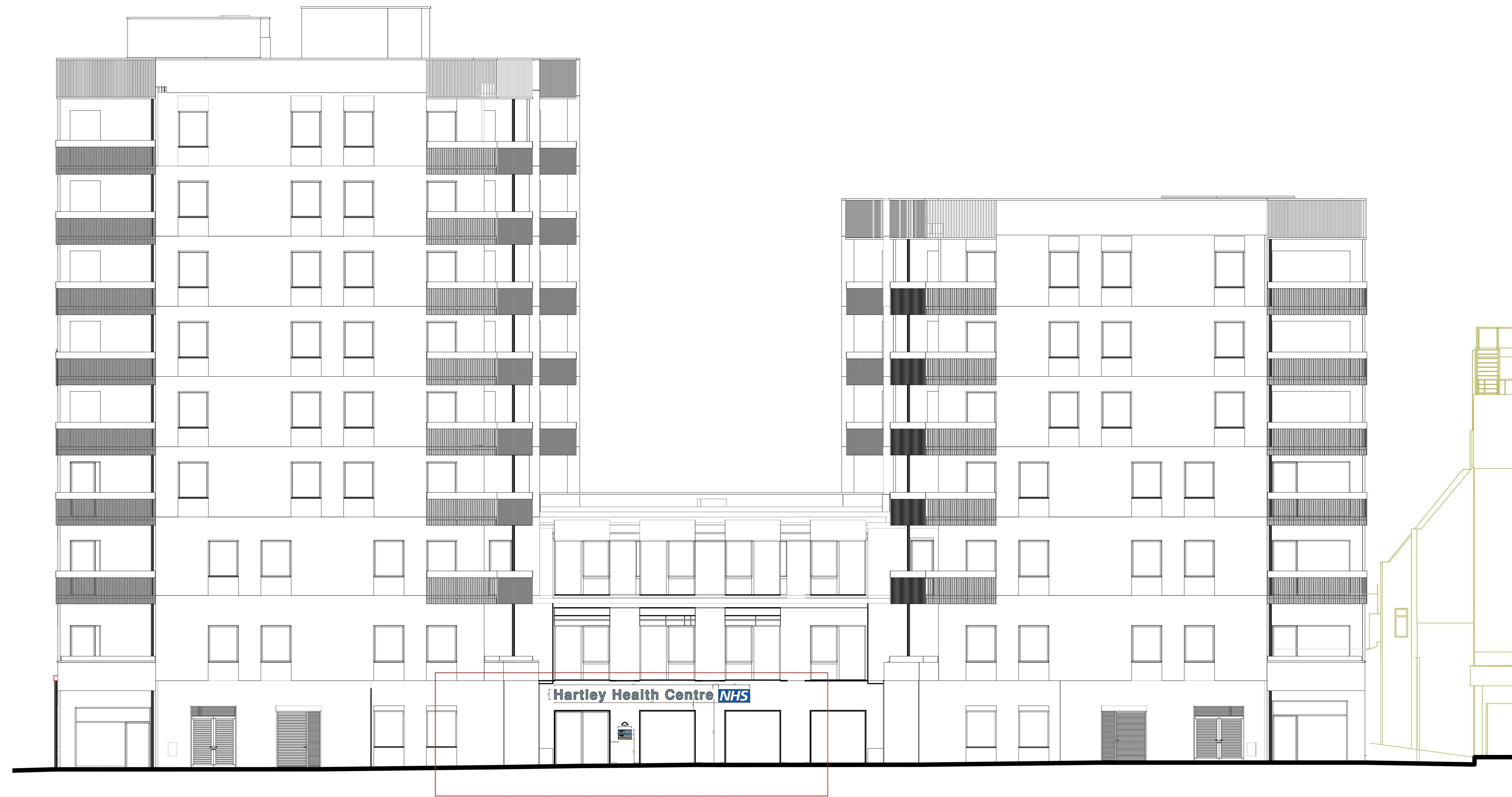
1 | 1:100 Barking Road Elevation