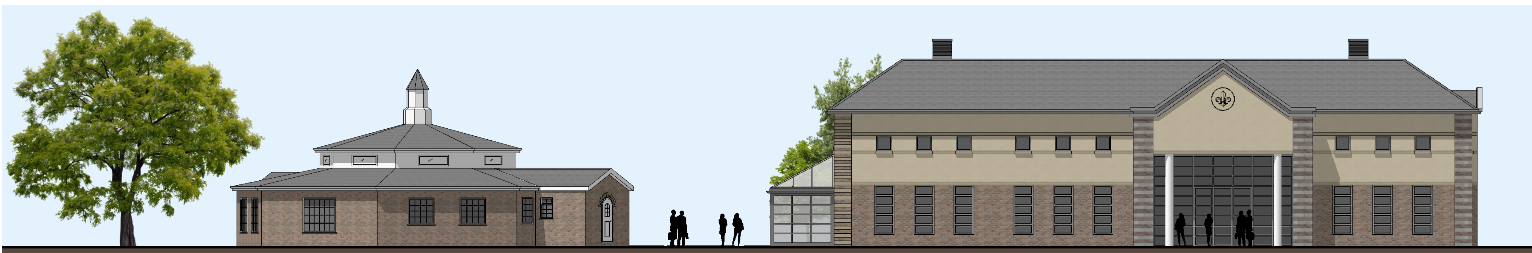
Existing South Elevation Scale 1:100 @ A1