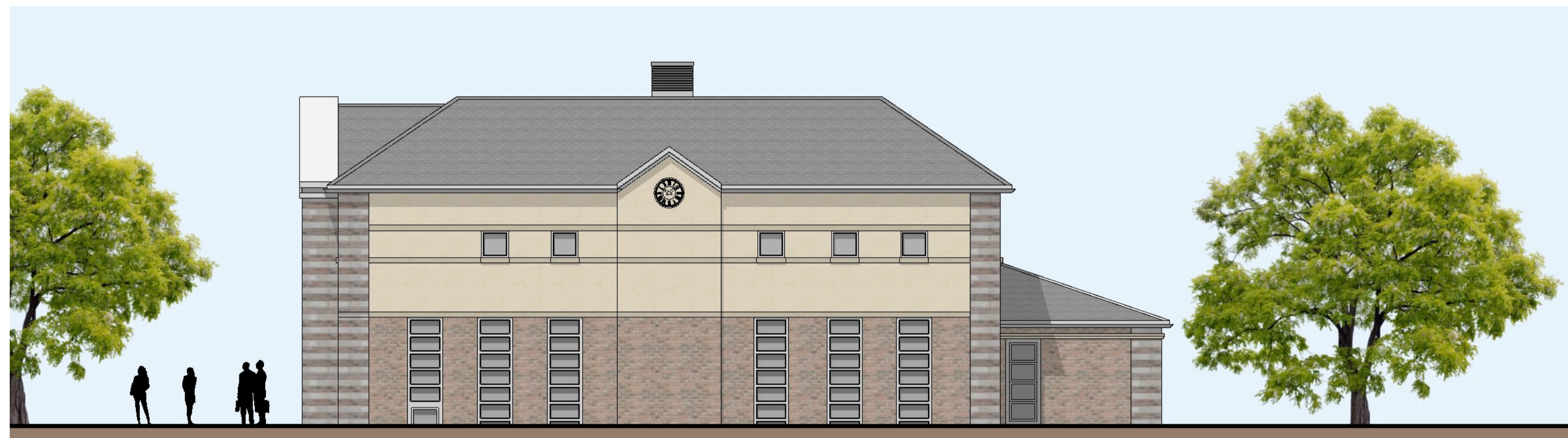
Existing East Elevation Scale 1:100 @ A1