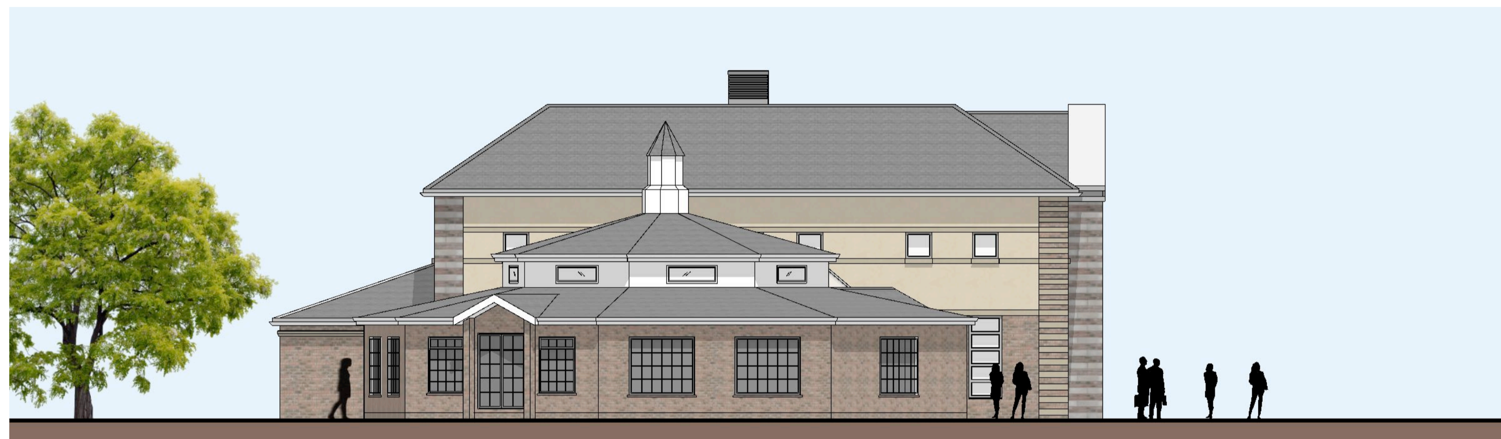
Existing West Elevation Scale 1:100 @ A1