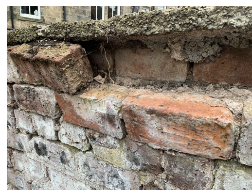
EXISTING DECAYING PARTY WALL