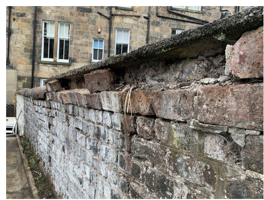
EXISTING DECAYING PARTY WALL