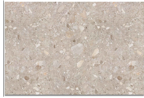
PROPOSED PORCELAIN PAVING SLAB PROPOSED SURFACE FINISHES PLAN