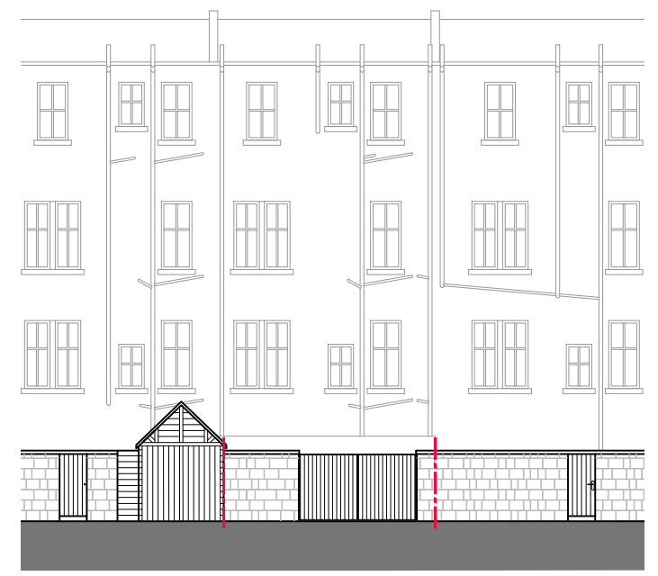
ELEVATION KEY Scale 1:200