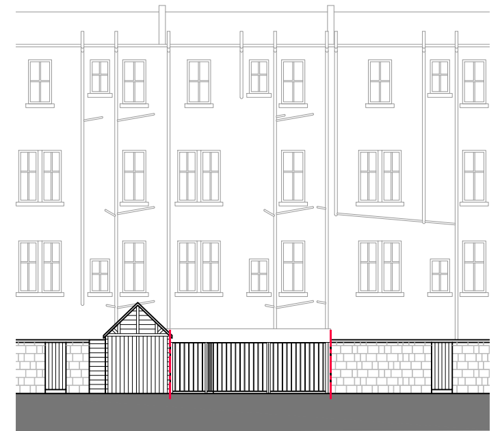
ELEVATION KEY Scale 1:200