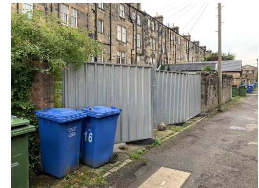
EXISTING TEMPORARY GATE