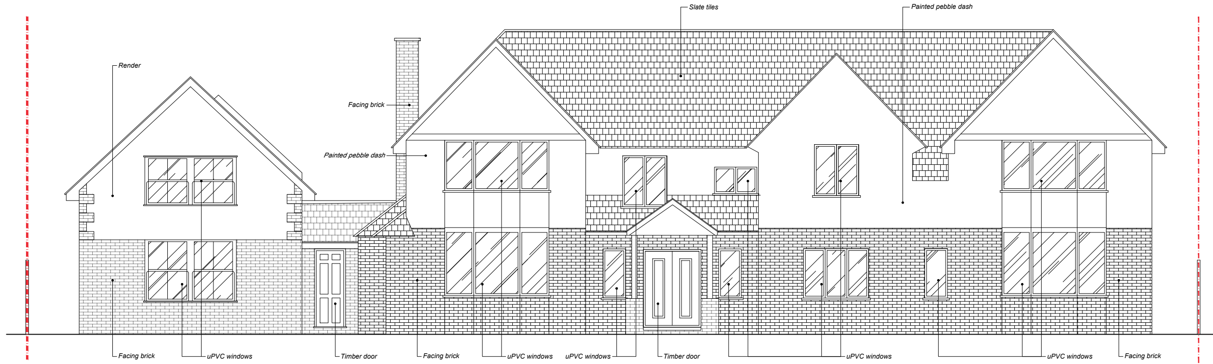
FRONT ELEVATION AS EXISTNG