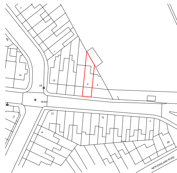
1 Location Plan Scale: 1:1250