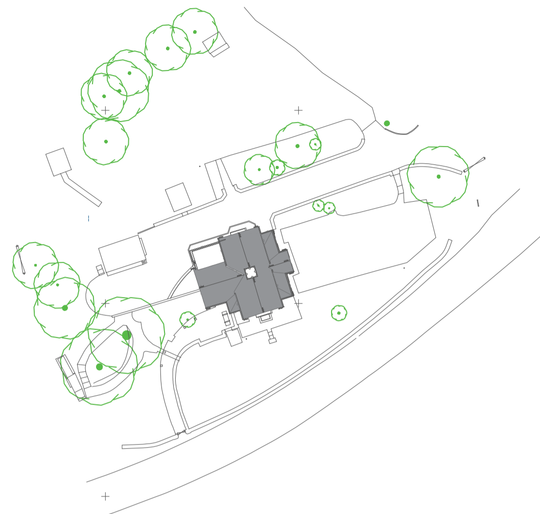
01 Site Plan 2001 1:500 @ A1

Extent of plaster damaged by moisture ingress requiring replacement.