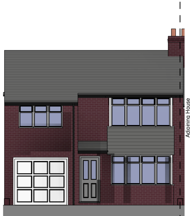
East Elevation (Slateacre Road) - Proposed 1 : 100