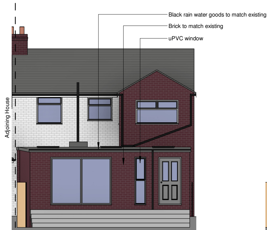
West Elevation (Rear) - Proposed 1 : 100