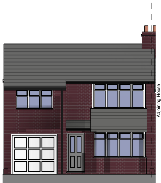
East Elevation (Slateacre Road) - Existing 1 : 100