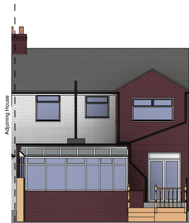
West Elevation (Rear) - Existing 1 : 100