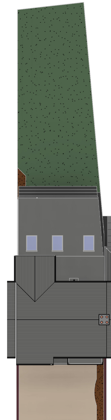
Site Plan - Proposed 1 : 200