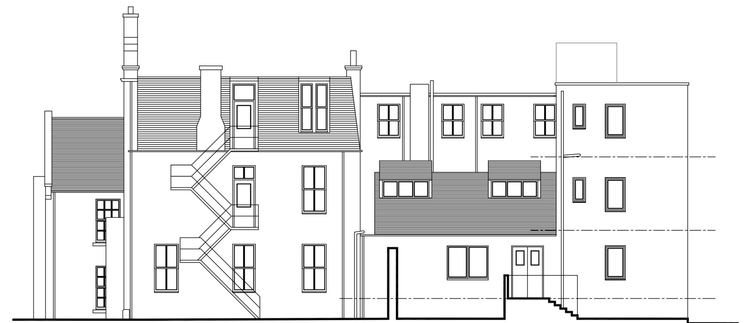
EXISTING SIDE (SOUTH) ELEVATION TO JUBILEE COURT. 1:100.