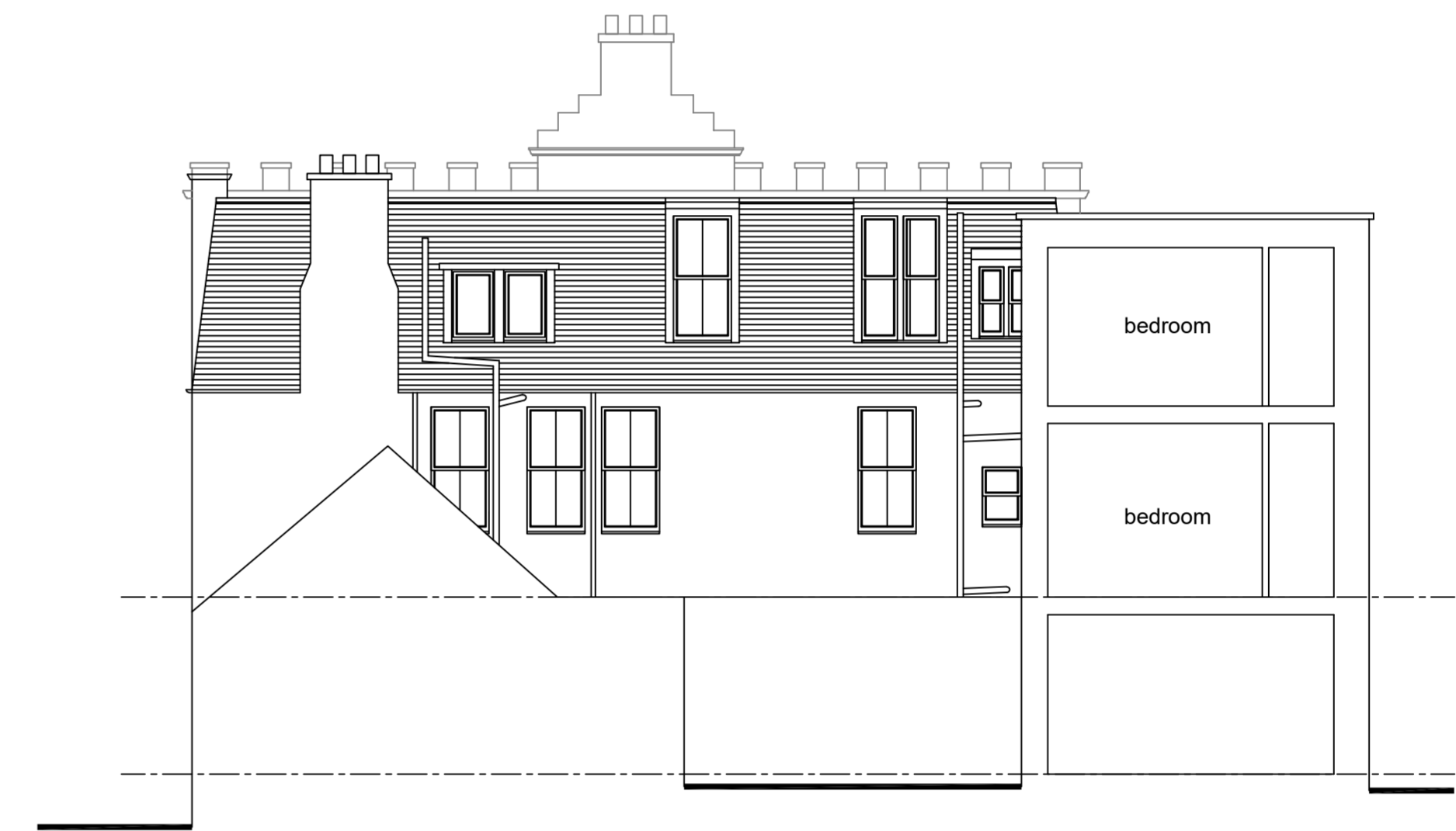
EXISTING INTERNAL REAR (EAST) ELEVATION TO REAR BEDROOM BLOCK. 1:100.