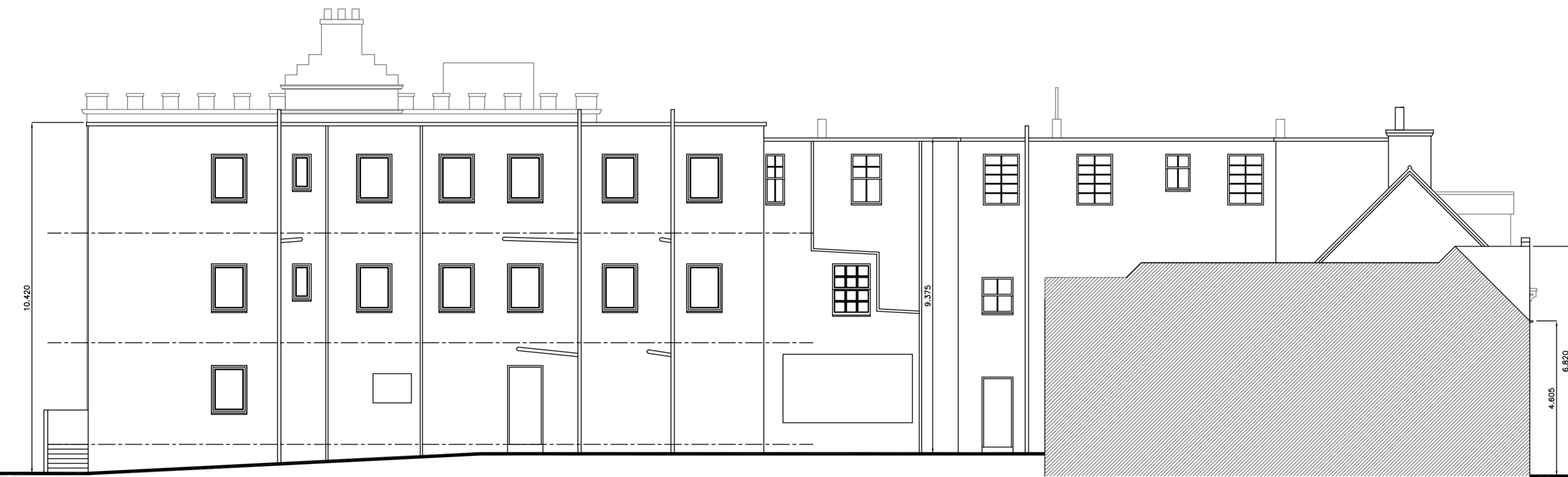
EXISTING REAR (EAST) ELEVATION TO INNER SERVICE AREA. 1:100.