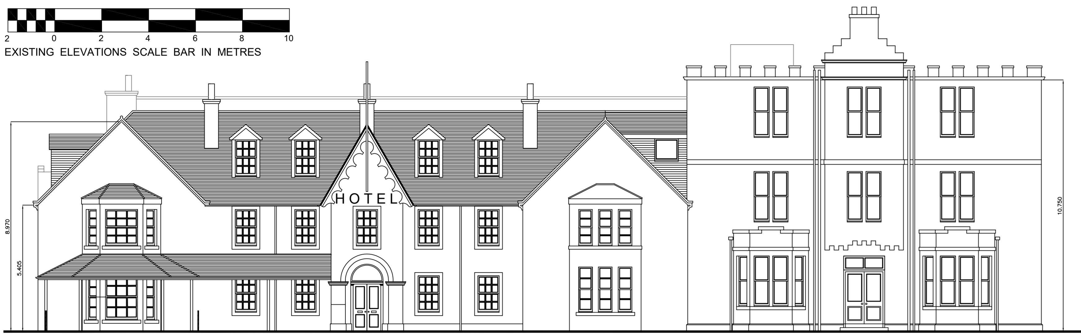
EXISTING FRONT (WEST) ELEVATION TO CAR PARK & CHARLESTOWN ROAD. 1:100.