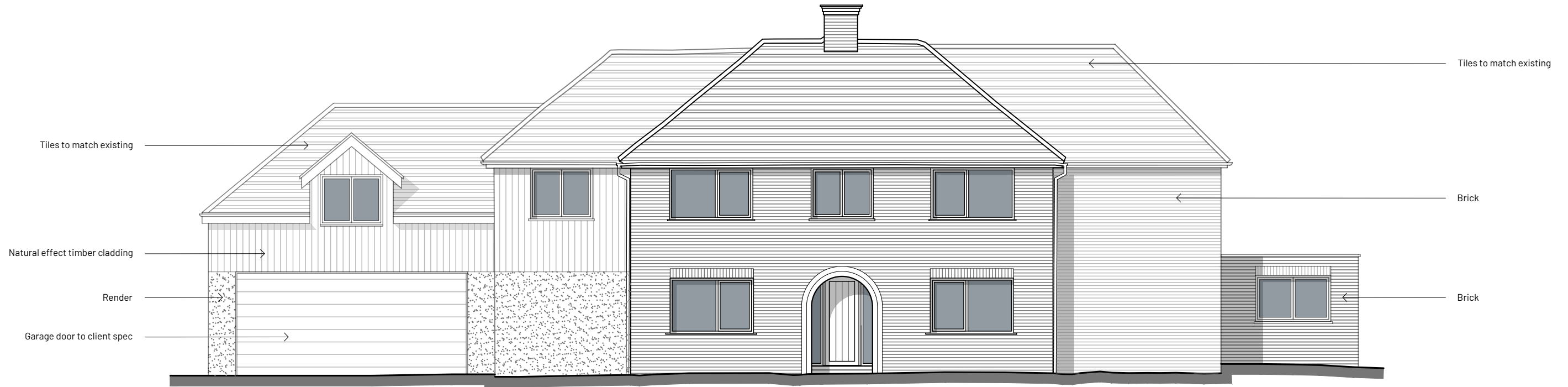
● SIDE ELEVATION (WEST FACING)