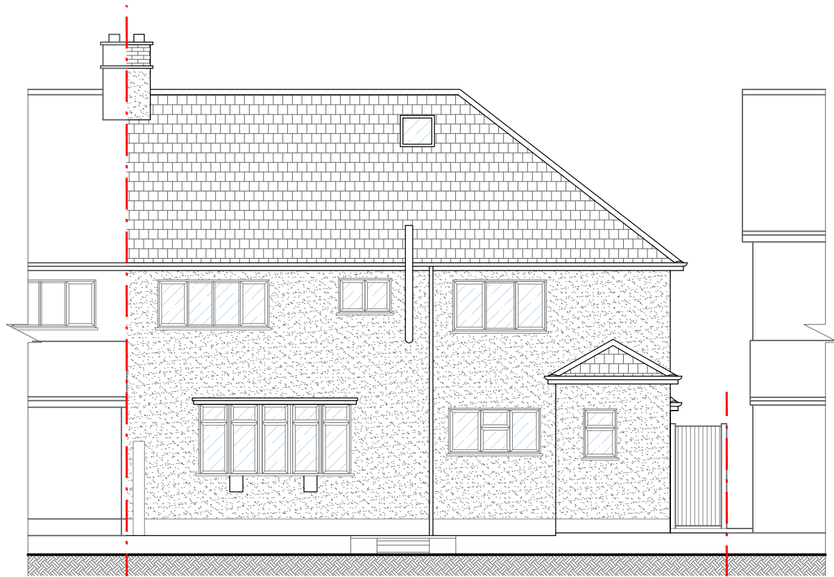
5 Existing North West Elevation 1:100 - Rear

The copyright in all designs / drawings prepared by Kirkwood shall remain the property of Kirkwood and must not be reissued / loaned or copied without prior consent.